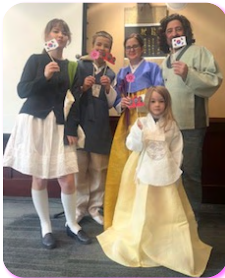
Part of my family donning a hanbok, traditional Korean dress. CultureFest at the University of Wisconsin, Eau Claire.

People generally do care and want to know more about you and where you've come from. They want to know your story, or how they can help. I've actually met people from all over the world in a matter of a few months. Venezuela, Nigeria, Mexico, Korea, Japan, Ukraine, Norway, and Germany, just to name a few. Some of these neighbors have shared their traditions through food, dance, music, writing, and art.