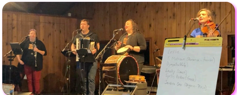
Orkestar Bez Ime at SNOPA!