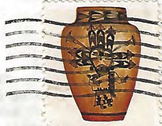
Hopi, Heard Museum Phoenix Pueblo Art USA 13c