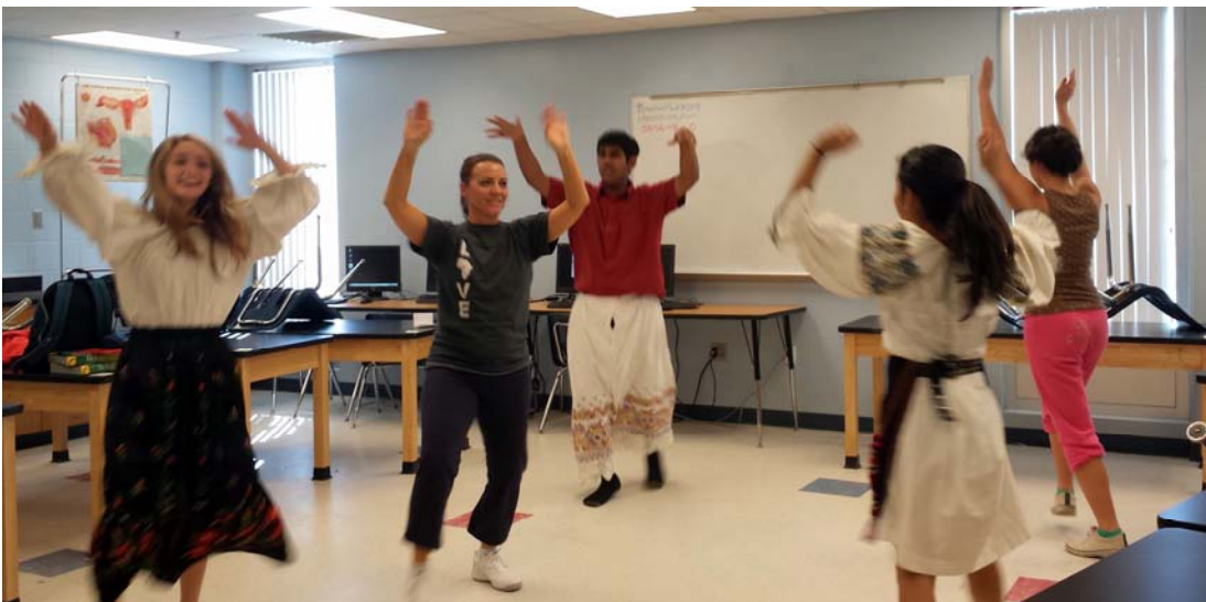
Radost Dance Club dancing Malhao