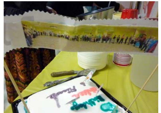
Orlando Dance Day Cake and banner

We hope everyone has a safe and fun summer. Remember that we do not dance in July and August. Come see us Wednesday nights in June, but always call first, since sometimes we have to cancel due to weather.