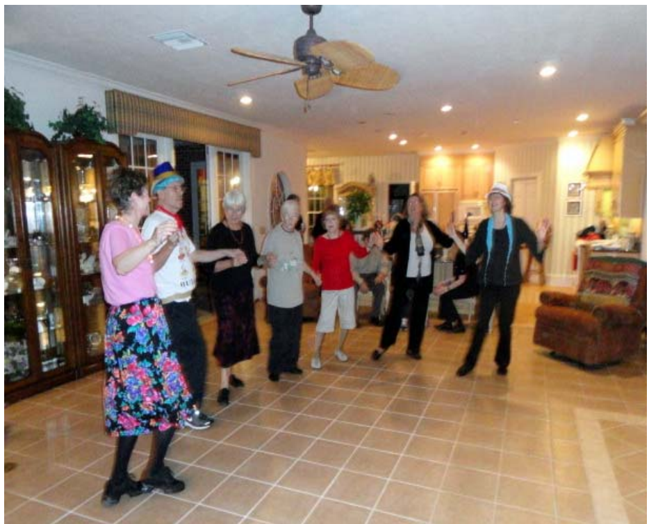
Gainesville group dancing on New Year's Eve