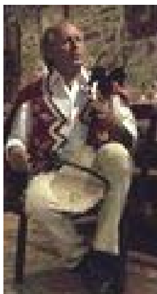
Albanian Lute player