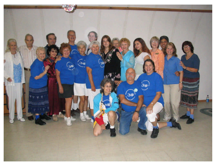
The OIFDC group picture on June 1, 2005

For those interested in our property situation: we are temporarily off the market while we haggle with the county about splitting the 8.5 acres into three parcels. So if anyone knows anyone who wants to move to Florida, tell them to contact us especially if they are a folk dancer!