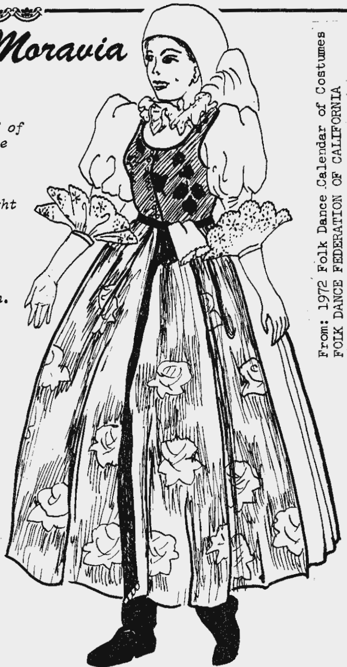
From: 1972 Folk Dance Calendar of Costumes FOLK DANCE FEDERATION OF CALIFORNIA