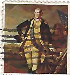
Washington at Princeton 1777 by Peale US Bicentennial 13c